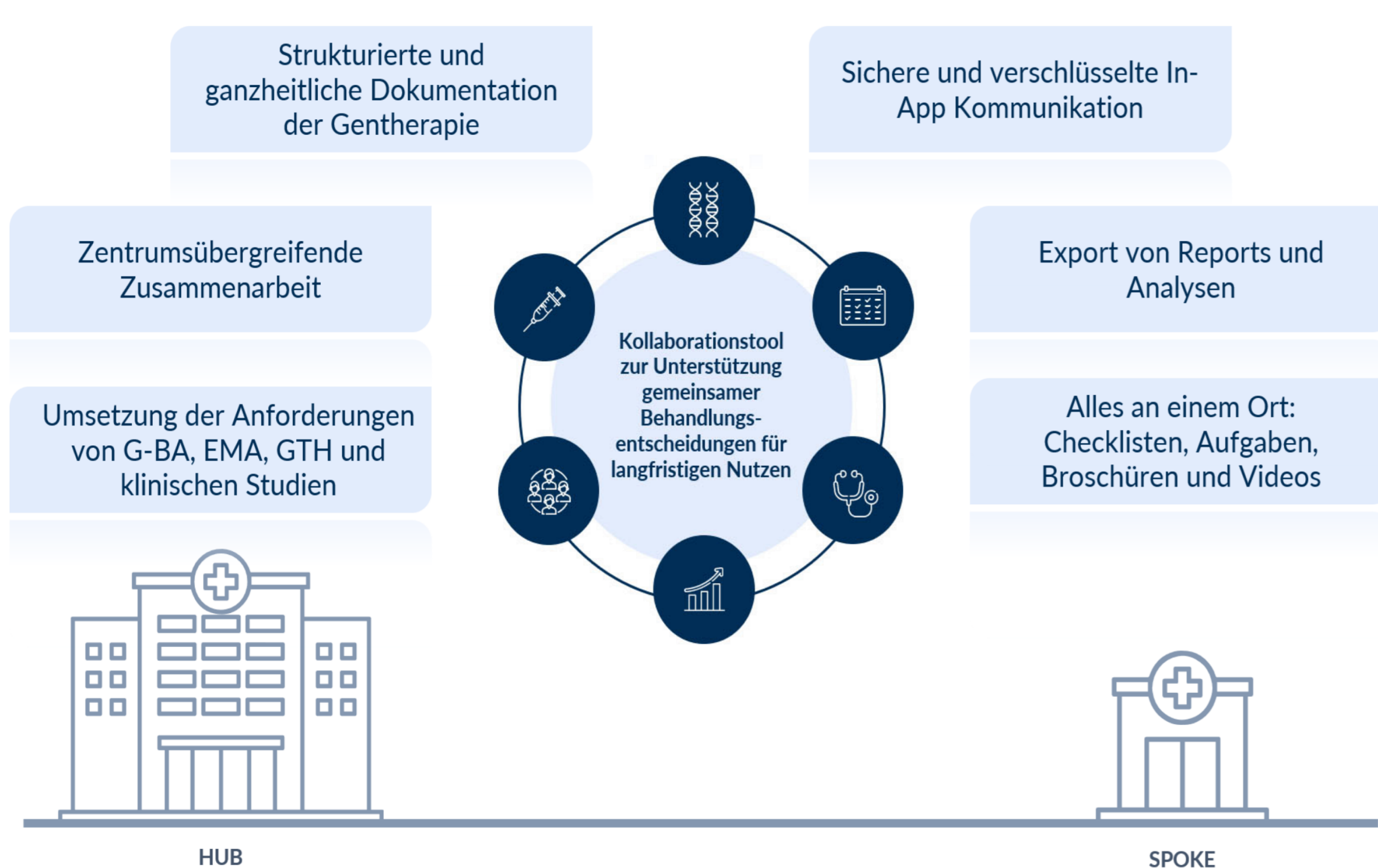
Fig. 1: Requirements of the Hub & Spoke Model

smart medication Gene covers all documentation and collaboration requirements between home center and dispensing center according to the Hub & Spoke model (see Fig. 1). The complex treatment process can be individually configured and adapted. For example, individual tasks can be assigned to the home center or the dosing center respectively. Tasks and results can be tracked, edited and marked as completed by the centers (see Fig.2). The entire patient journey is mapped: from initial discussions, patient education and proper documentation of a informed consent, outcome of the AAV test, preparation and application of gene therapy and follow-up after application of gene therapy.